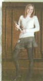
Fashion Show Saturday & Sunday